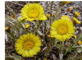
Coltsfoot Tussilago farfara

MAYAPPLE The two leaves of the Mayapple plant resemble a parasol. It produces one white flower and the ripe fruits are edible. Recipes for jellies and pie as well as juice are available.