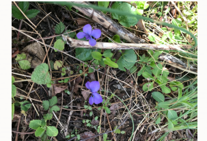
Sweet Violet Viola odorata

TROUT LILY is a wonderful little Spring blooming bulb. The pattern of the leaves suggests the marking of a trout fish. The bloom time coincides with the trout fishing season which may explain the wide use of the common name