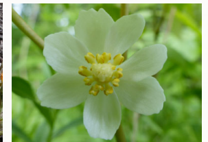
Mayapple Podophyllum peltatum

WILD GERANIUM is a perennial shade-loving plant that blooms from April to June. It grows in patches of flowers on slender stalks that attract bees and early butterflies. Herbal medicine uses the root as an astringent and the leaves for tea.