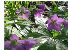
Wild Geranium Geranium maculatum

SWEET VIOLET flowers are synonymous with Spring in Pennsylvania. Their clumps of fragrant blooms are sheltered by heart-shaped leaves. They are deer and rabbit resistant. The flowers are edible and are often used in cake decorations.