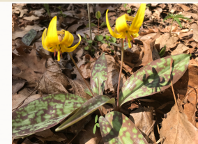
Trout Lily Erythronium

CUTLEAF TOOTHWORT The spectacular finely cut leaf of the Spring blooming Toothwort are divided into five margins. The nectar of the flowers attracts bees and early spring butterflies. It is a very beautiful plant with white flowers that doesn't spread vigorously.